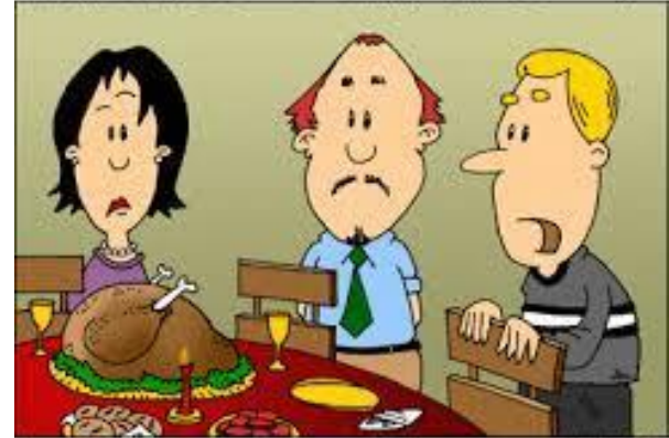
(See Psalm 100) 11-28-2007 HAS IT ALREADY BEEN A YEAR SINCE WE WERE THANKFUL?