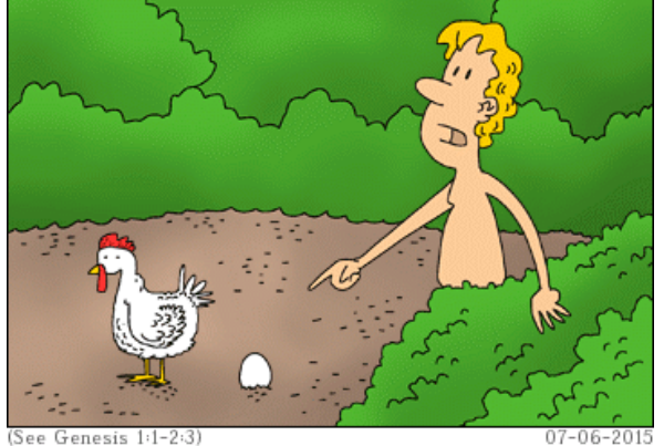
I MISSED IT ... WHICH ONE CAME FIRST?